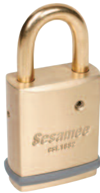
SFIC 760 Series