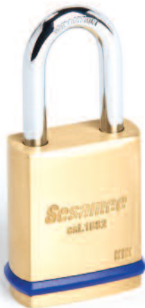
KIK 860 Series