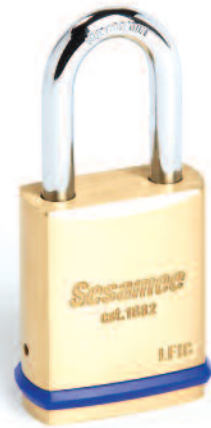
LFIC 560 Series